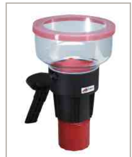
Solo 332 Aerosol Dispenser for larger diameter detectors.

The Solo 332 is available for detectors with larger bases.