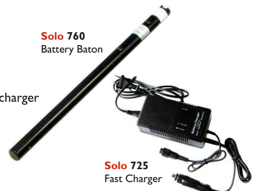
Solo 725 Fast Charger