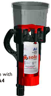
For use with Solo A4

The Solo 332 is available for detectors with larger bases.