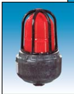
XB15 Pipe Mount Note: UL only (with cast guard)