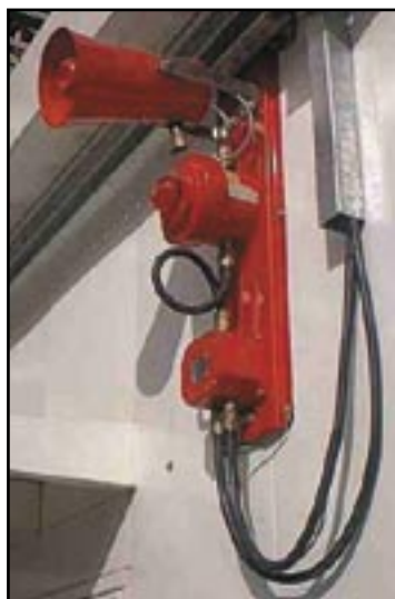
Example of installed combination unit